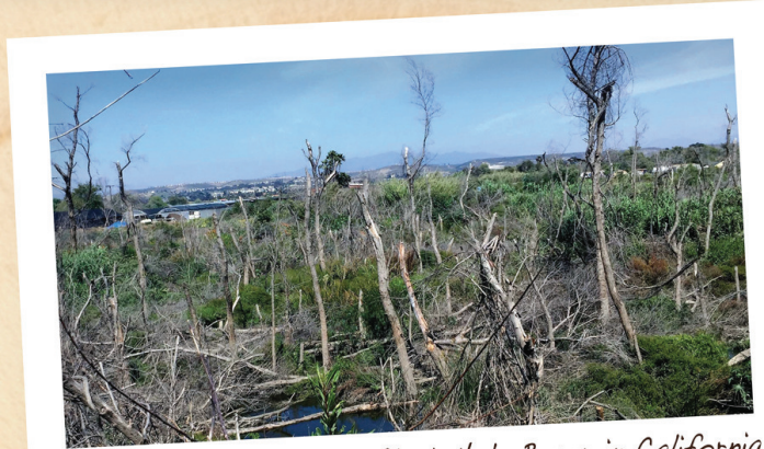
Trees killed by Invasive Shot Hole Borer in California.

Prevention is key – don't move firewood when traveling and don't bring it back home from a trip.