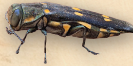
Goldspotted oak borer

Keep your backyard, campgrounds, and favorite places safe from these insects and diseases — buy firewood near where you will burn it.