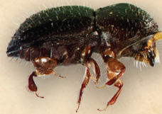
Invasive shot hole borers